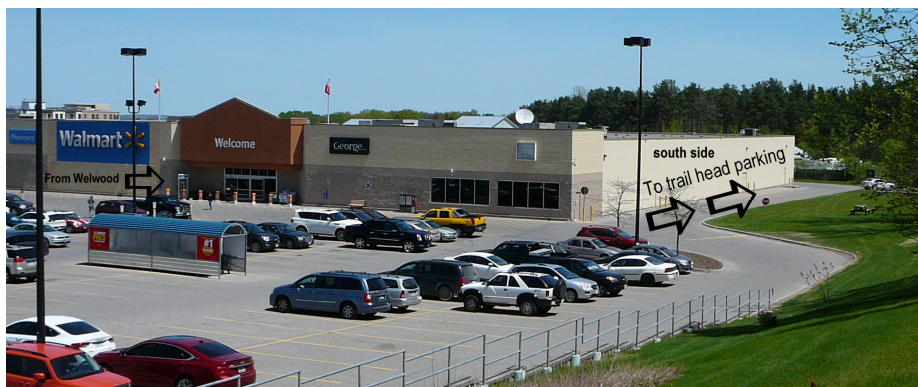
Follow the arrows to the parking lot of Uxbridge Countryside Preserve