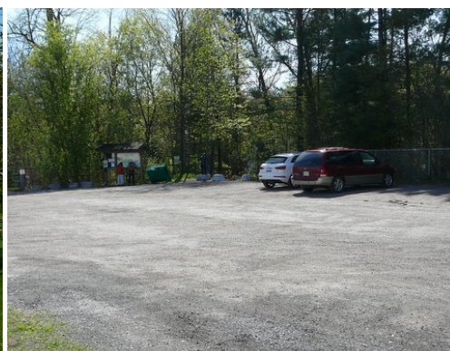
Parking lot of Countryside Preserve